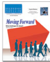
SECONDARY MARKETING EXECUTIVE