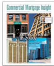
Commercial Mortgage Insight